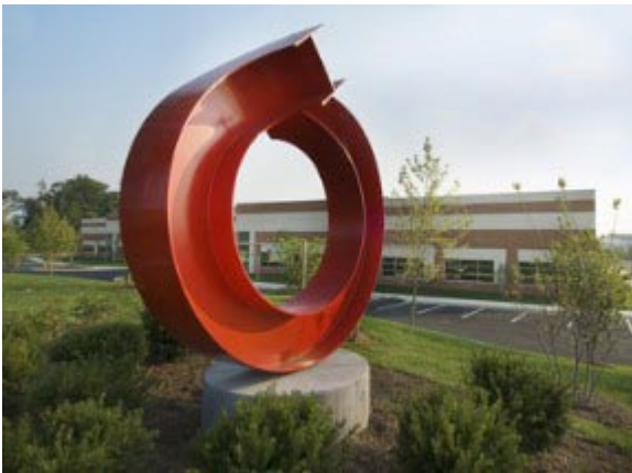
Sculpture at Buchanan Partner's Innovation Center