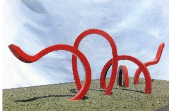
Maquette of 'Red Nessie'.