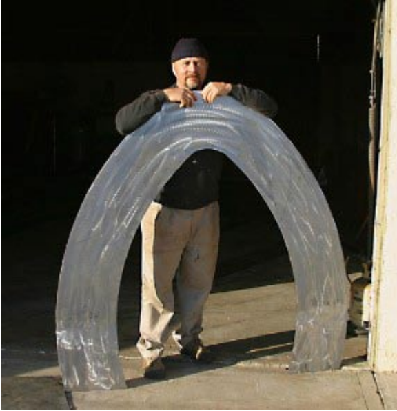
The first recognizable piece of 'Red Nessie'.

are looking forward to her trek across the states and installation later this spring.